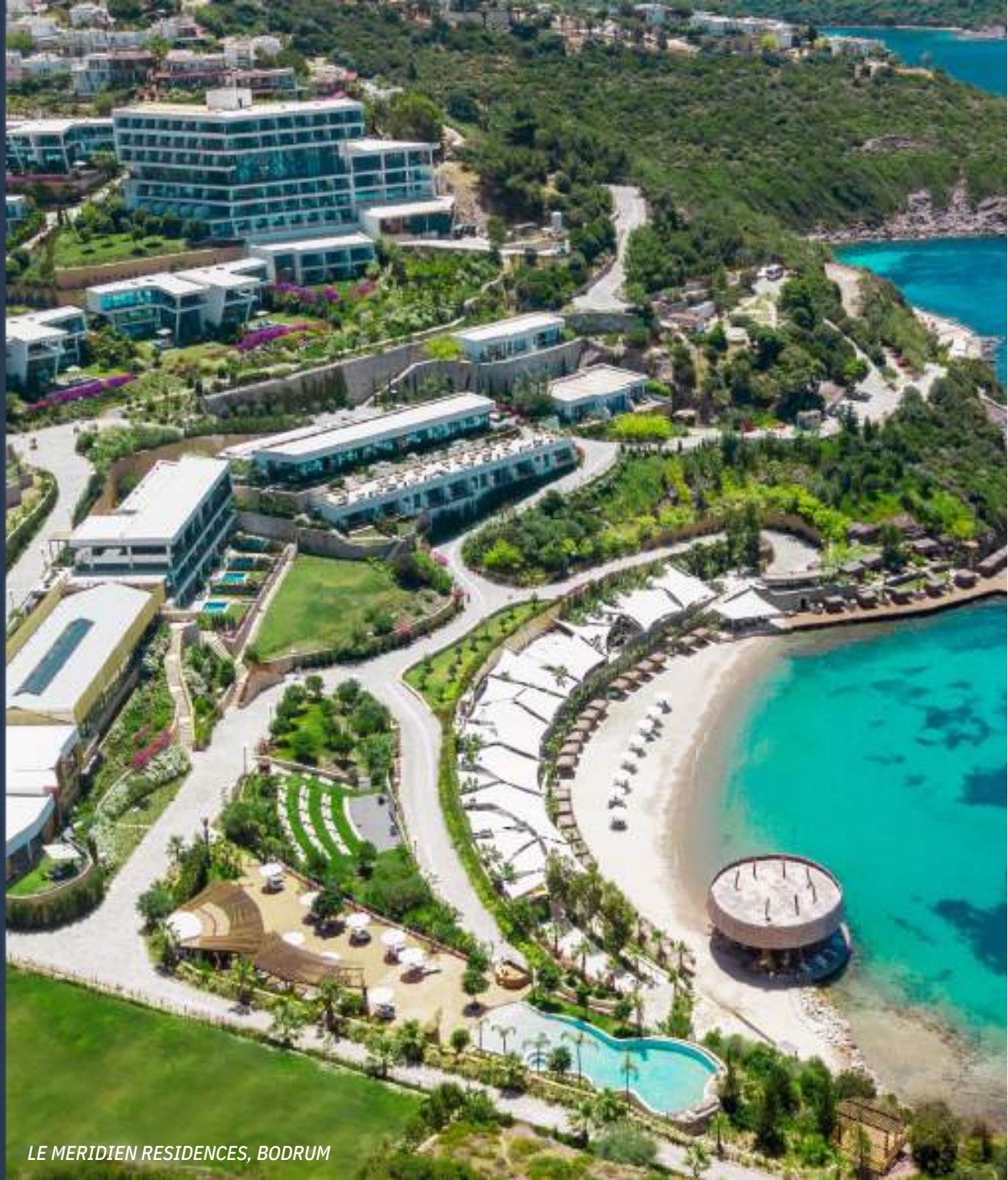
LE MERIDIEN RESIDENCES, BODRUM